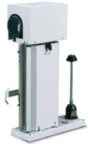
Pre-stretch film carriage