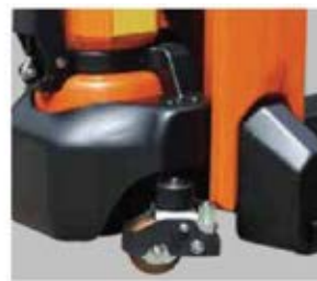
Optional Stability Castors