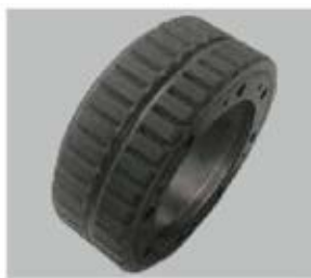
Optional high traction drive wheel