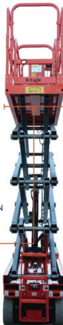
SC08-10HN/EN (N=Narrow) W: 0.81 M

Automatically record operating time. User can perform periodic maintenance at the proper intervals