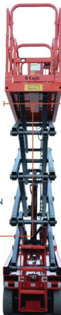
SC08-10HN/EN (N=Narrow) W: 0.81 M

Automatically record operating time. User can perform periodic maintenance at the proper intervals