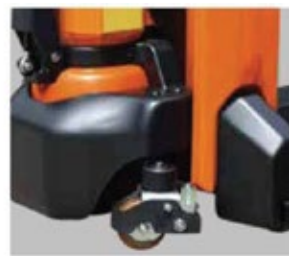
Optional Stability Castors