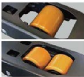
Optional tandem fork rollers