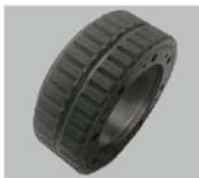
Optional high traction drive wheel